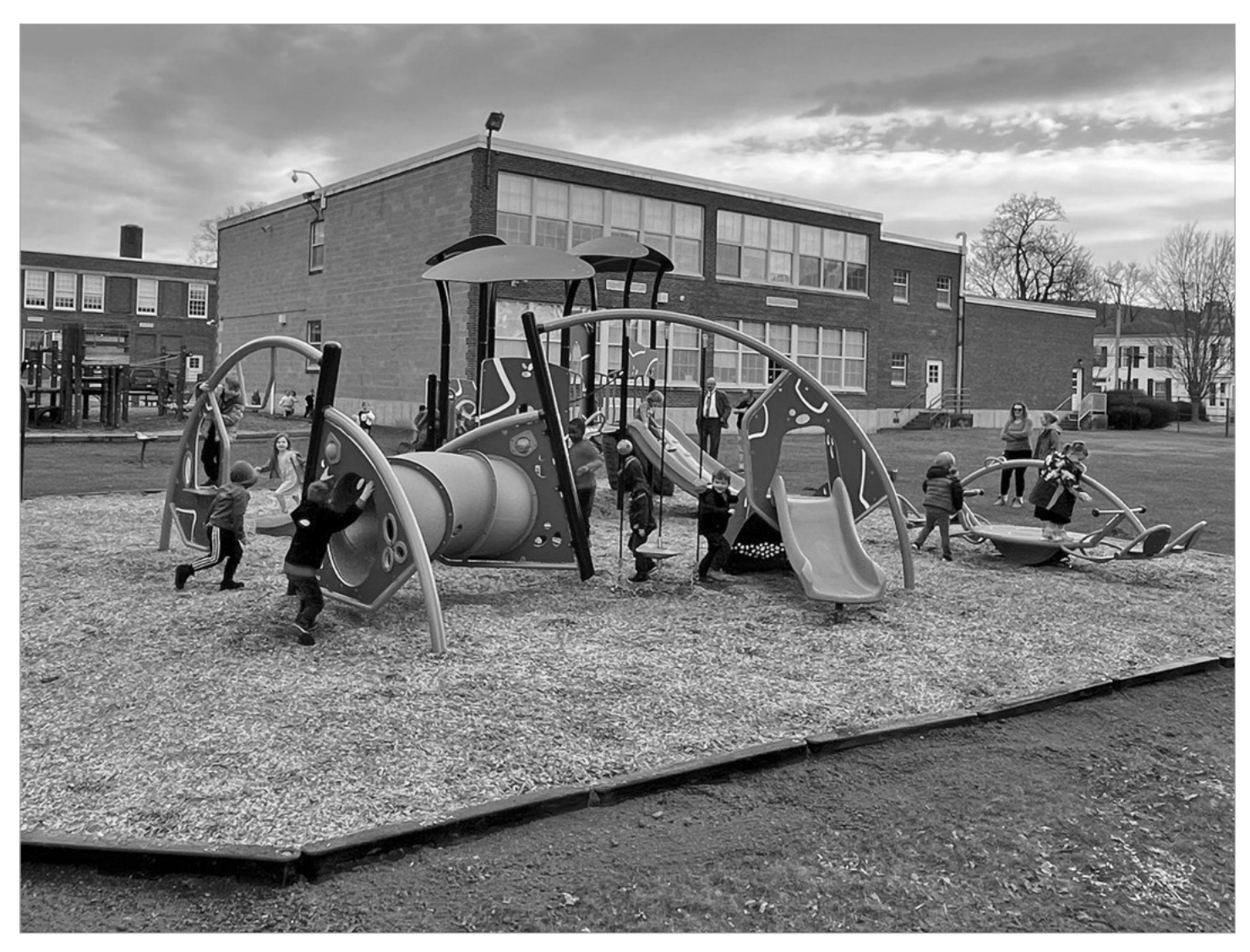
UPK students are enjoying the new piece of playground equipment that was purchased with grant funds

* A monthly amount for the tax changes is provided as a convenience since most home mortgages are set up with a monthly tax escrow feature.